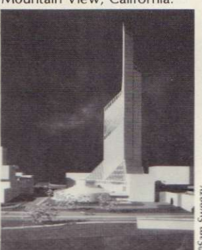
51 Required reading

Academic Center, Boston University. Central Research Library, Dallas. Federal Correctional Institution, Bastrop, Texas. Operations and Maintenance Building, Multnomah County, Oregon. Police Services and Fire Administration Building, Mountain View, California.